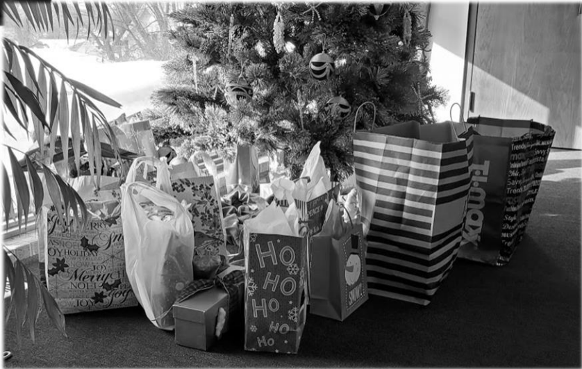
Gifts for the Chatfield Christmas Project & The Maple Leaf Services Project